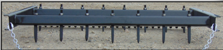
3" Offset Easy-to-Replace Harrow Tines