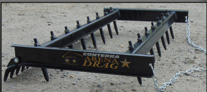
Swept tines help the Drag maintain contact with the ground, reducing the bounce.