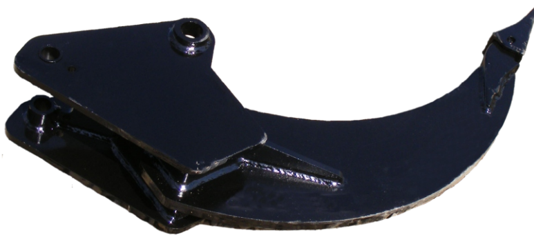
Optional Ripper Tooth (Pins on in place of the bucket)