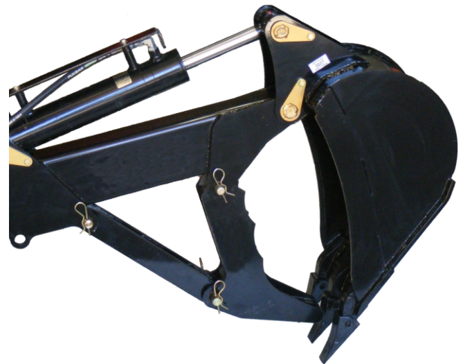
Shown with optional Manual Thumb