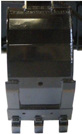
Bucket wear plates, base edge & flush mount adapter with pin on teeth