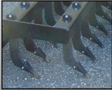
Two Rows of Easily Replaced Scarifier Teeth