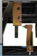
Easy-to-Read Depth Gauge