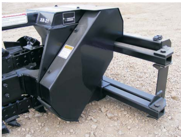
Heavy Duty Direct Drive eliminates chain reduction and decreases moving parts