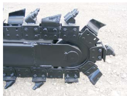
50,000 lbs. Digging Chain ... the best in the business