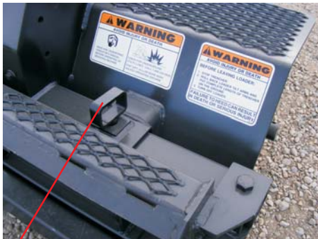
Manual Side Shift allows for trenching again obstacles