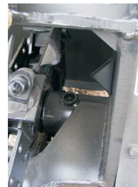
Serviceable Main Drive Shaft