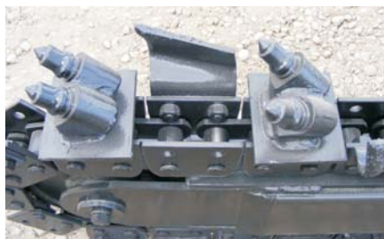
1/2 Rock 1/2 Frost Digging Teeth

All Models include a Trench Cleaner / Crumber to level out the bottom of the trench