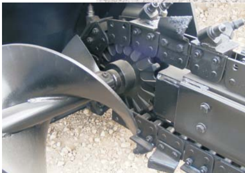
Spoil Auger moves material to one side of the trench and away from trench opening