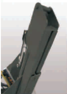
Unique closed design slide channel keeps out unwanted debris