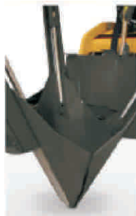
Cuts a 30" diameter root ball, 29" deep with fully truncated blades. Blade angles are at 25 degrees