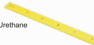
Optional Poly Urethane Cutting Edge