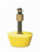
Optional Urethane Skid Shoe