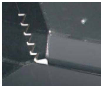
Unique holding power is found in the serrated teeth