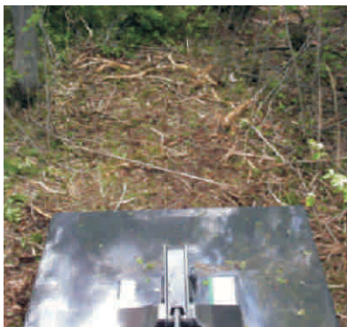
Large 6" diameter rear roller with greasable bushing