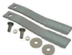
Replacement blade package with blades, bolts, nuts and washers.