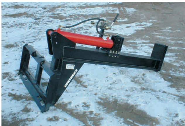
New model not exactly as shown