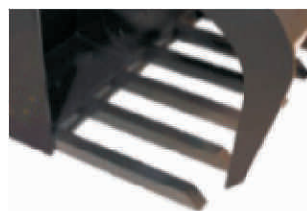
Replaceable lower tines