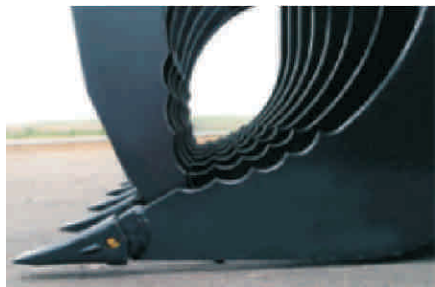
Unique serrated edges provide grip to keep items from rolling out.