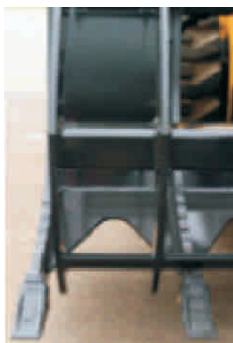
Gusseted between teeth for added strength.