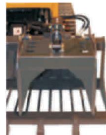
Heavy-duty 1" x 8" cutting edge for extreme use