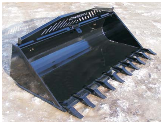
SHOWN WITH OPTIONAL MATERIAL GUARD