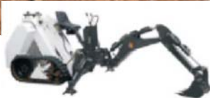
ES 640 for Mini Skid Steer Loaders